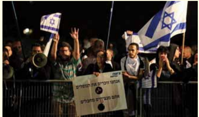
Demonstrators against the Memorial Ceremony