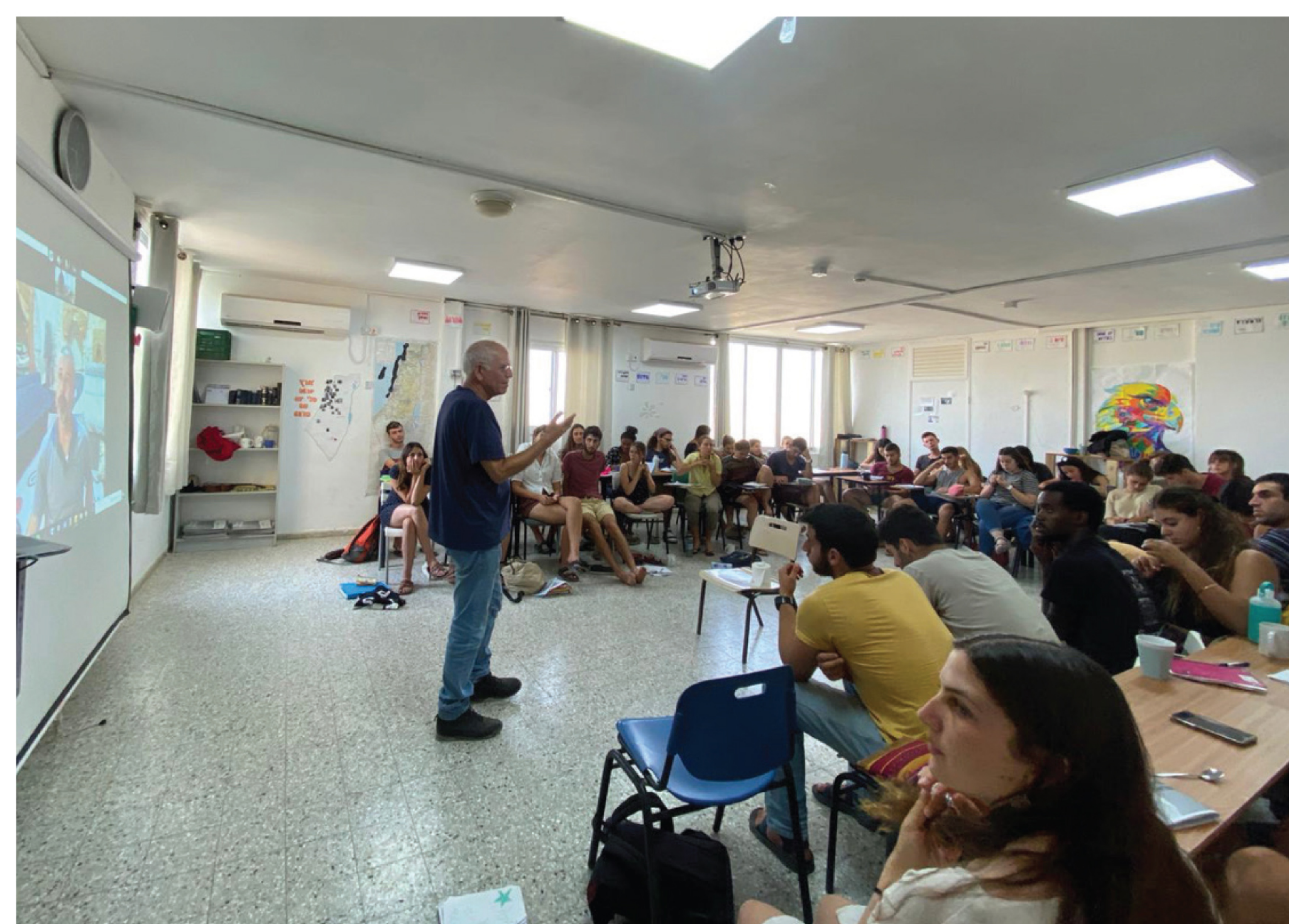
Hybrid DM: Israeli facilitator in person and Palestinian on zoom

“This was a once in a lifetime experience- to meet, hear and speak to someone from the other side. I learned so much and it increased my desire for peace”.