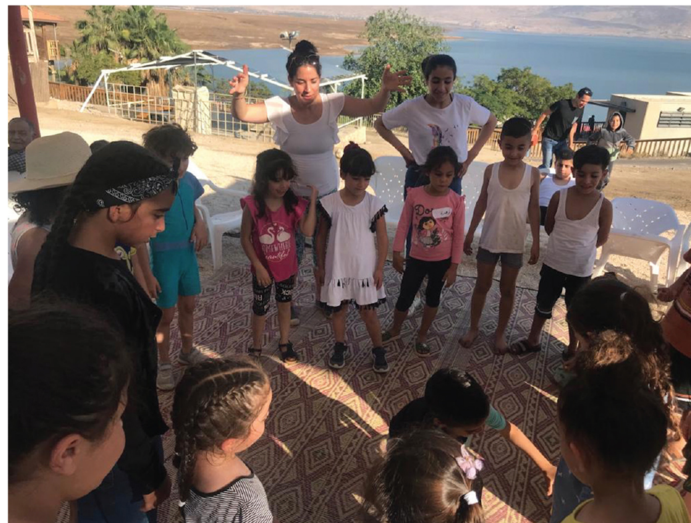
Leading activities for children at the members picnic

In August, members of the YAP program worked hard at the Summer Camp as counselors and assistants. The skills they acquired were put to work in additional activities they conducted with the summer camp youth, such as a tour in Jaffa, and leading children's activities at the Member's Picnic gathering. No doubt - they are our future leaders.