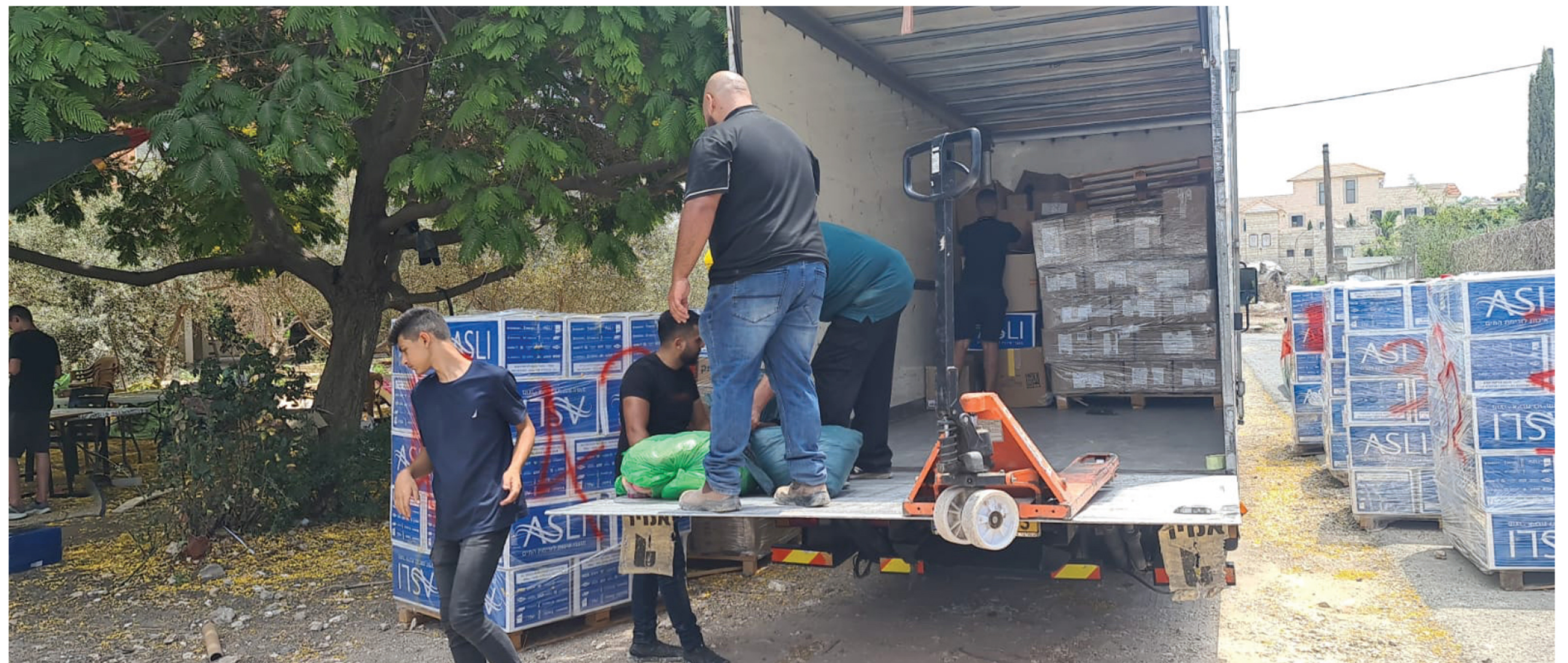
Solidarity activity - bringing much needed supplies to Palestinians in the West Bank