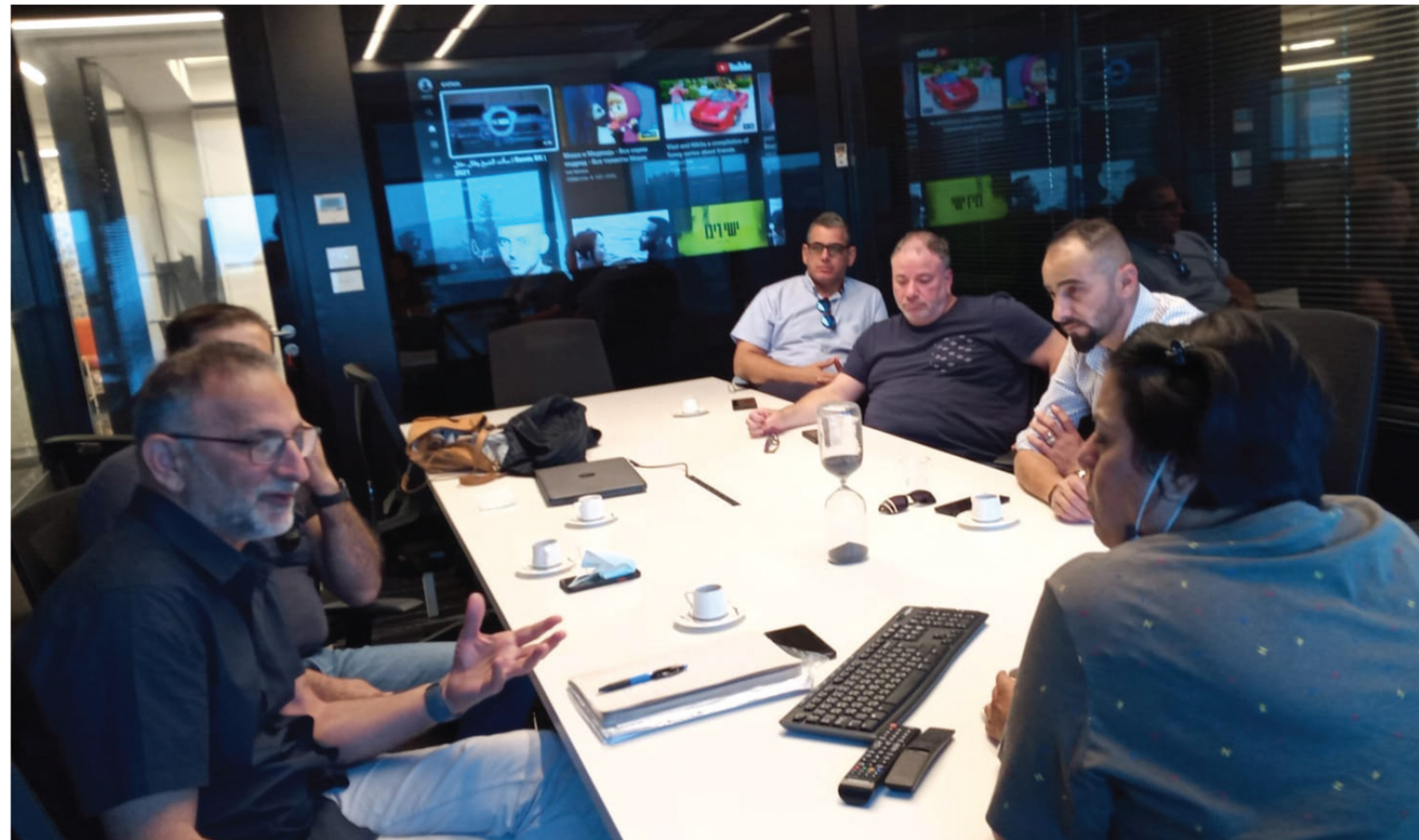
PCFF meeting with journalists in Jerusalem

During the war between Israel and Gaza, the Parents Circle was invited to speak all over the media, both at home in Israel and Palestine, and around the world. Christiane Amanpour opened the door by interviewing two members on CNN. It was followed by PBS and the BBC and more than 40 global outlets. The Parents Circle was prominent in many demonstrations against the violence: "Jews and Arabs refuse to be enemies" and "Stop the Occupation" are examples.