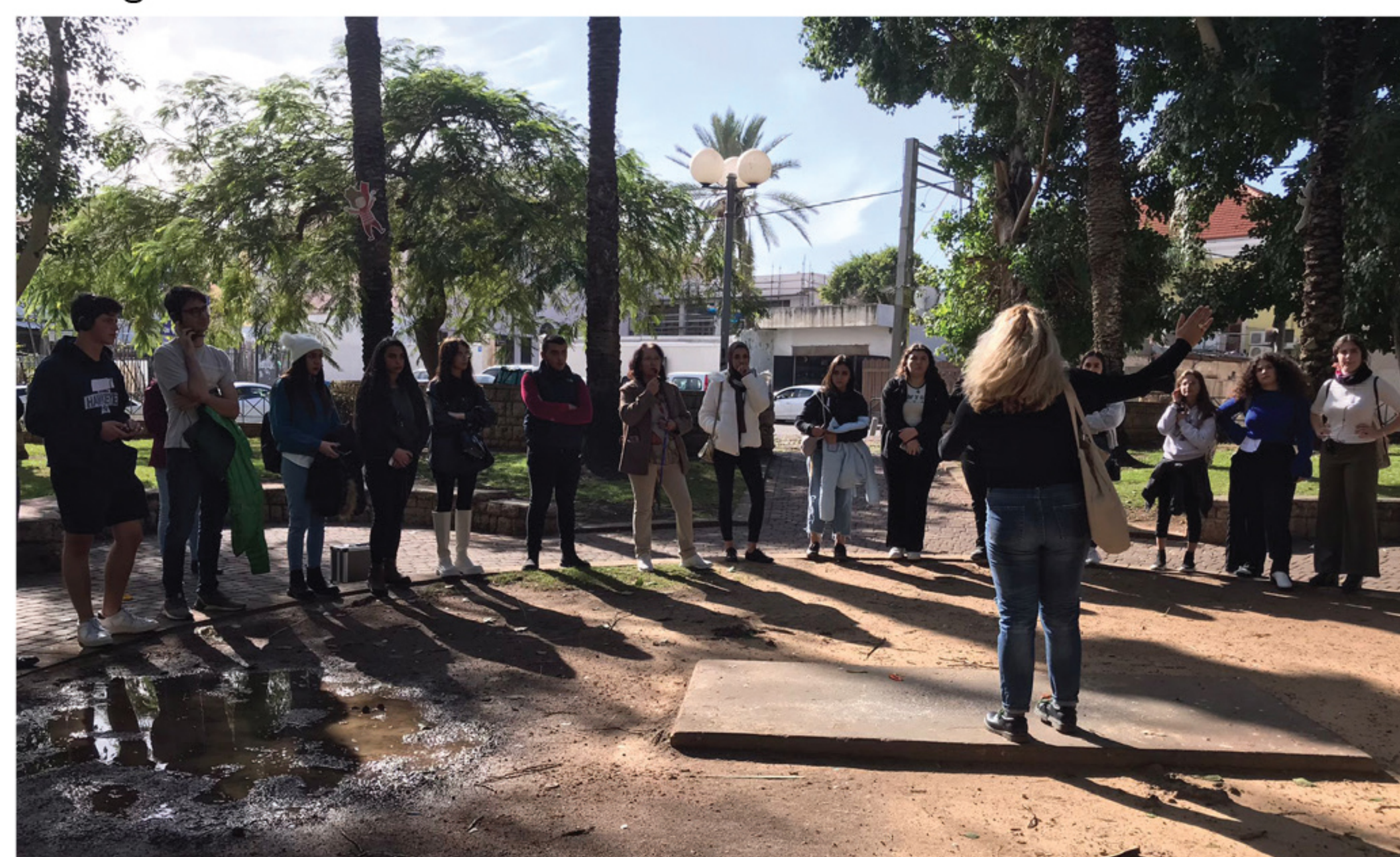
Preparing for a tour of Jaffa