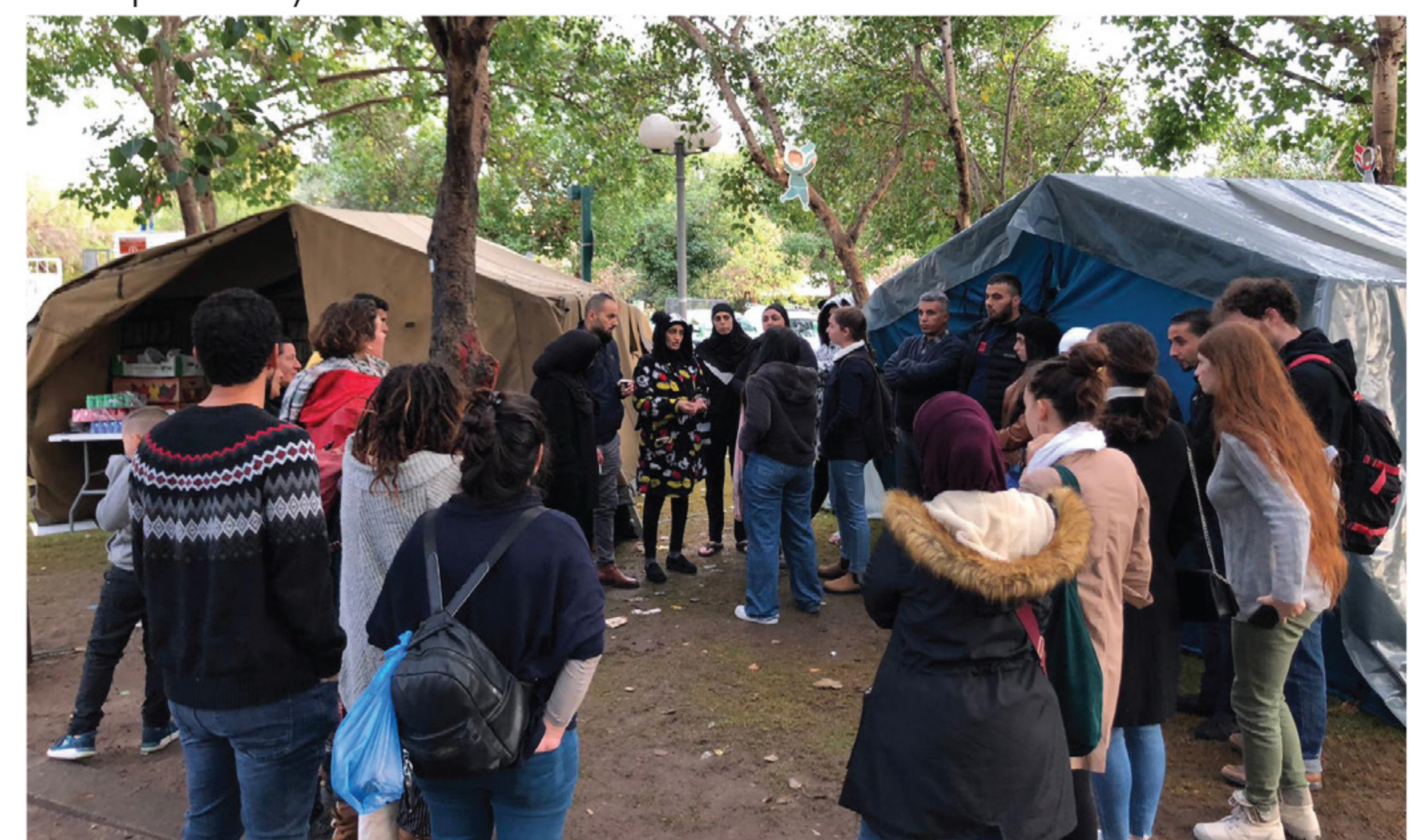
Touring an eviction of residents protest site in Jaffa