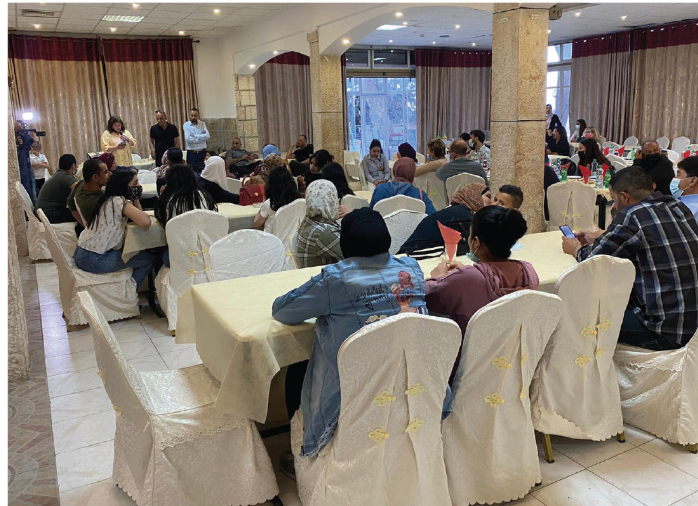
Iftar in Beit Jala – finally together