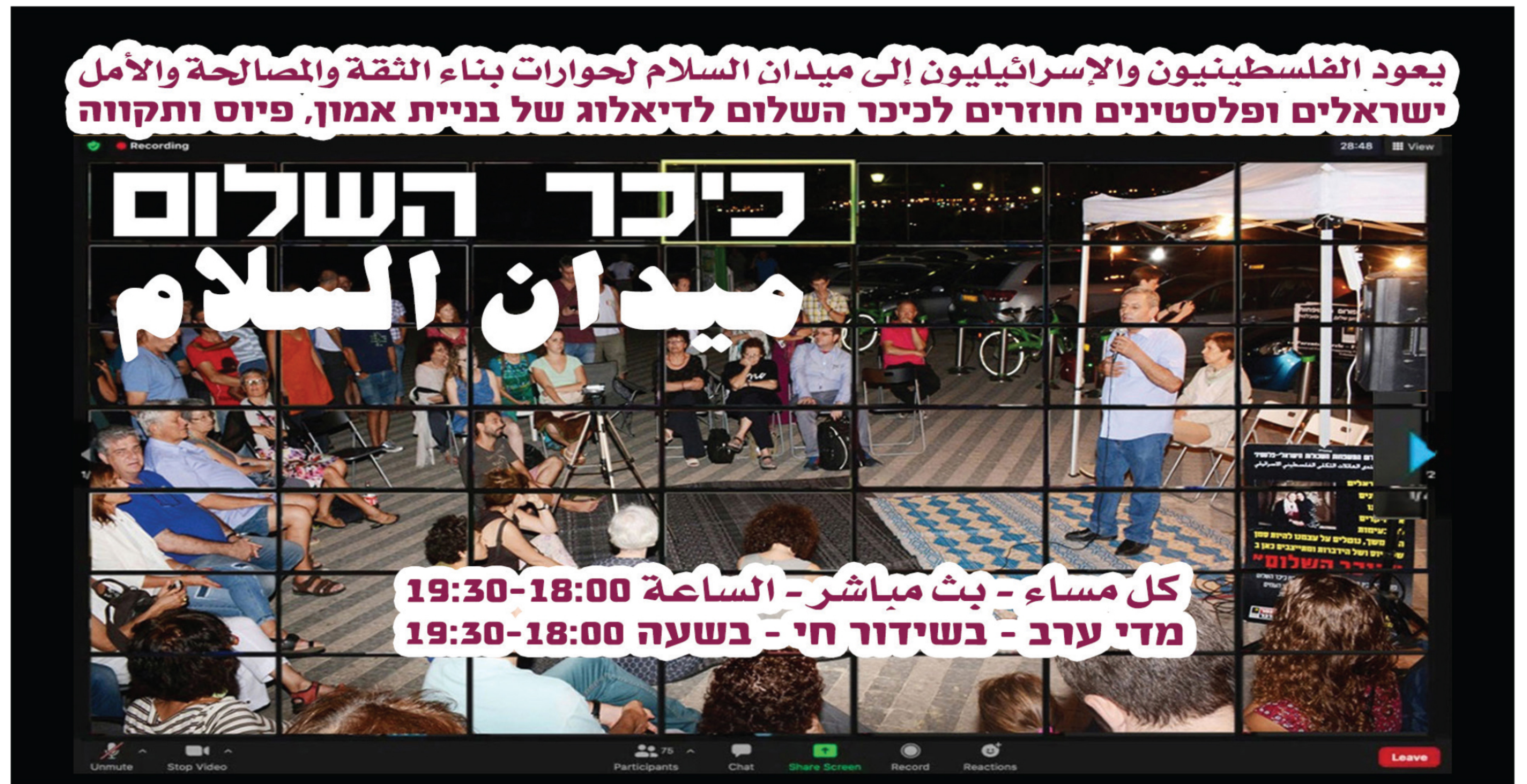
Virtual Peace Square

This was the only venue of its kind. A unique “safe space” was created where people could meet together, albeit on Zoom. Hundreds of people attended and the fact that there was bi-lingual translation made it more accessible to all.