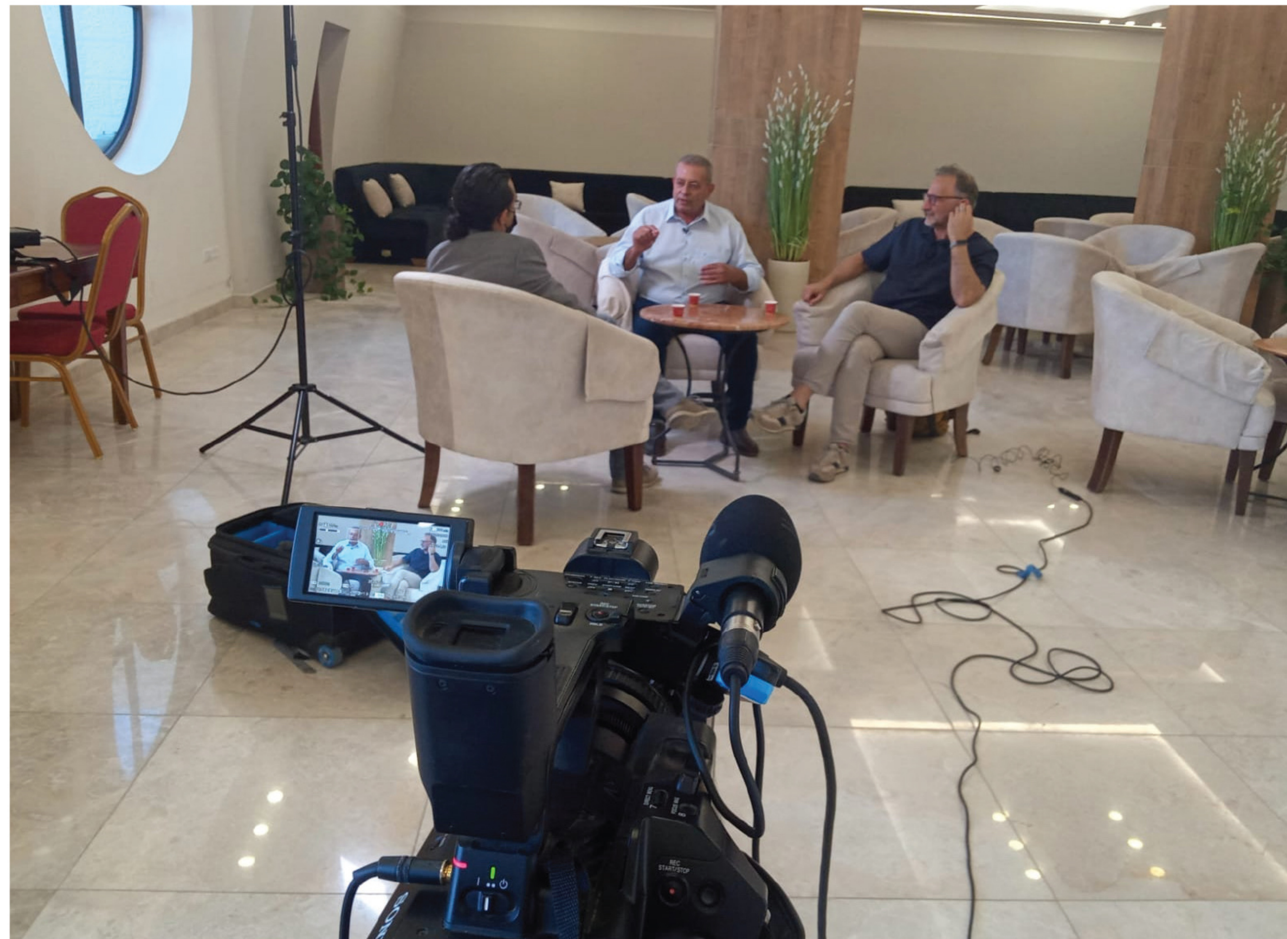
PCFF in the media