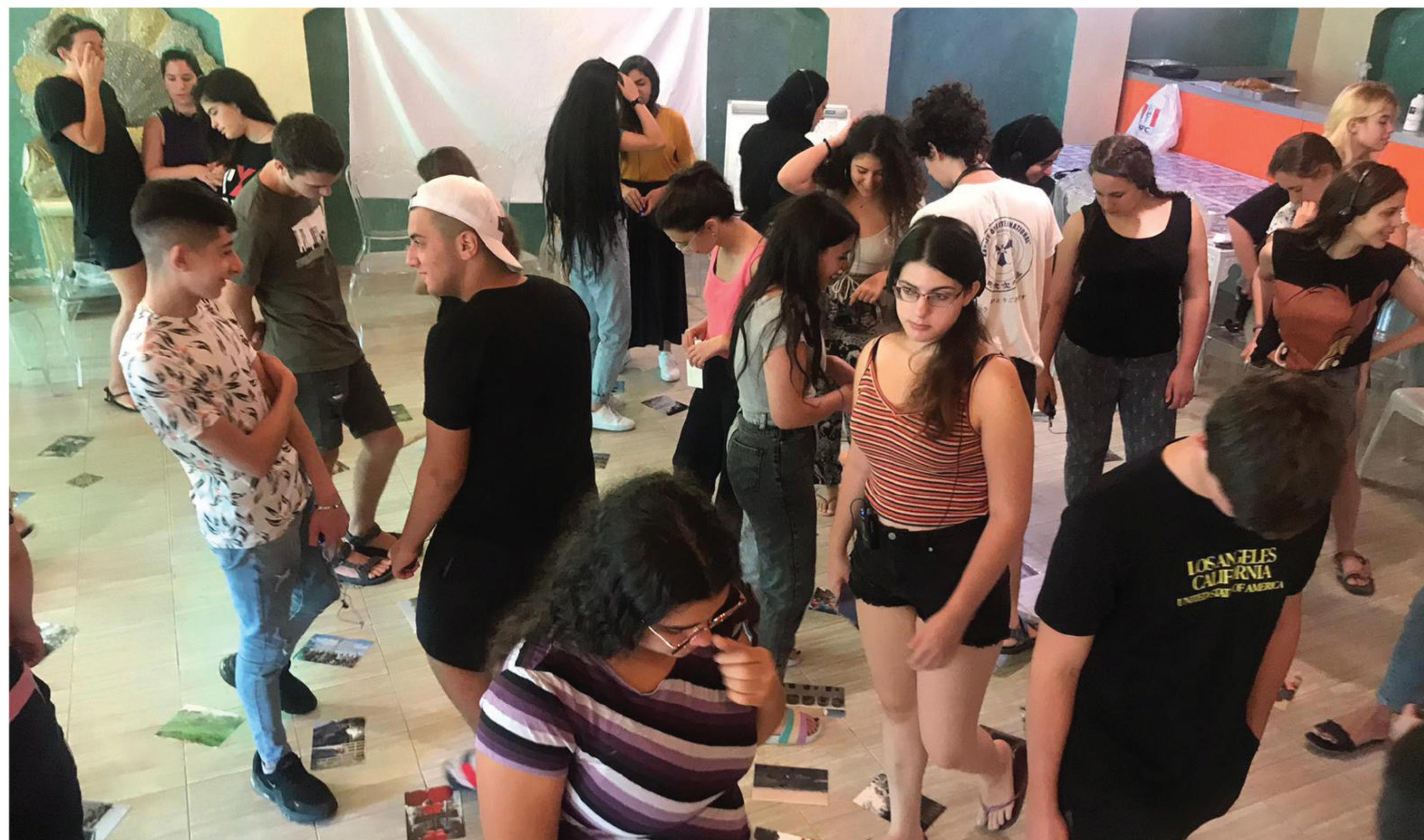
Summer Camp activity