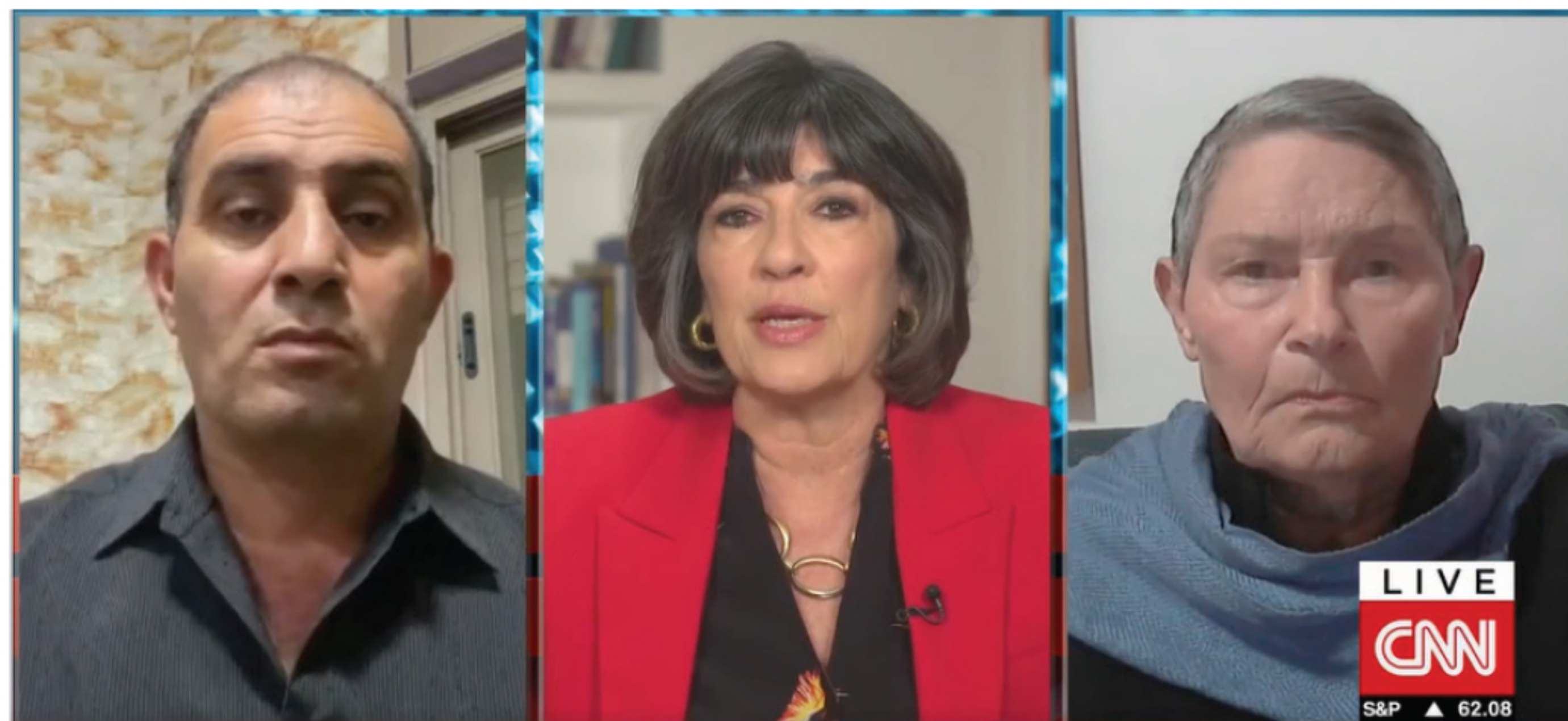
PCFF on CNN