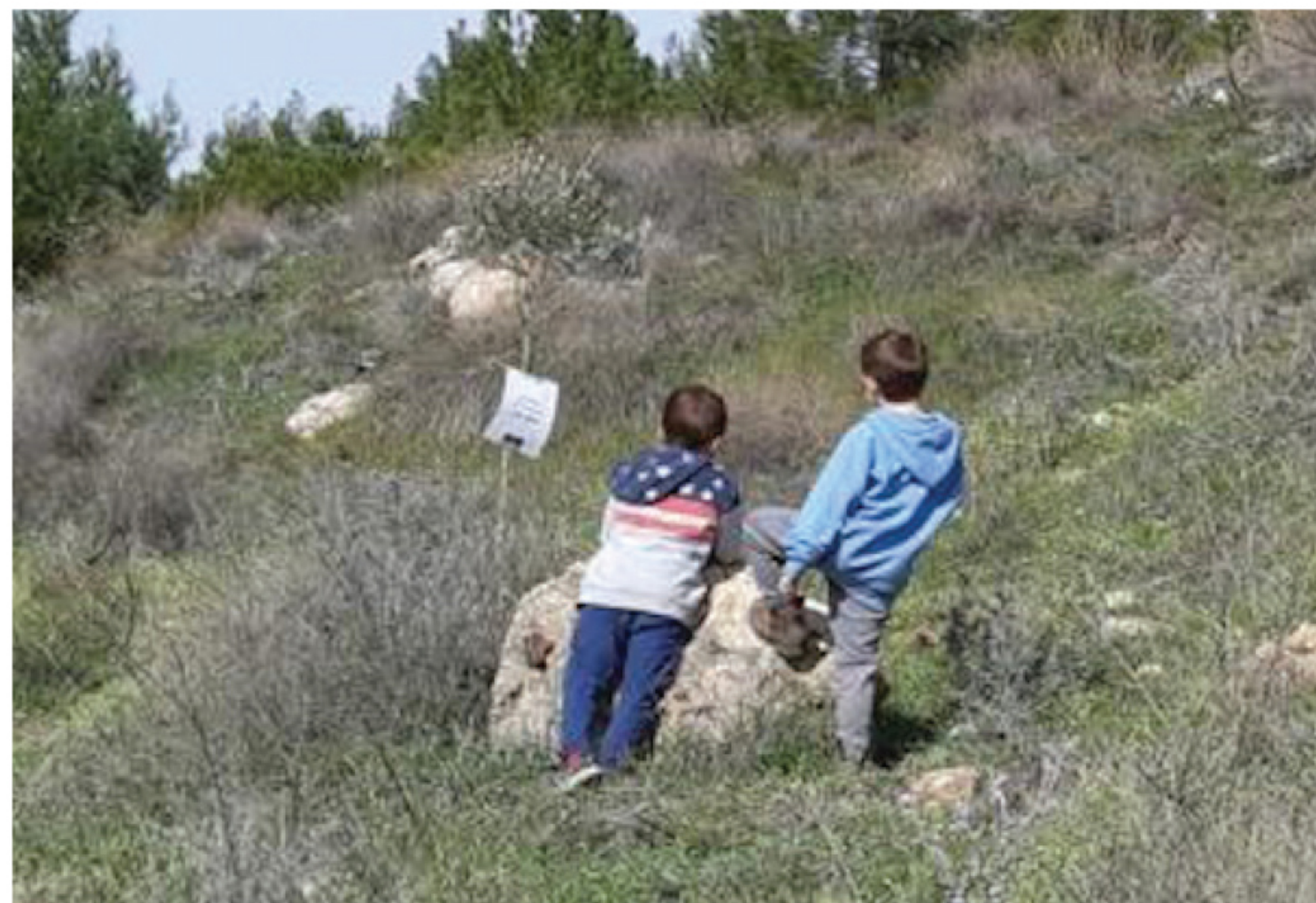
Tree planting - for the PCFF next generation too

One of the ways to celebrate the Jewish Holiday Tu B'shvat, is by planting Olive Trees. This year Palestinians and Israelis planted 20 trees in memory of twenty family members of the Parents Circle. We intend to plant another 20 trees for 20 more members every year, signalling the beginning of an annual tradition. Olive trees are historically symbolic for both sides.