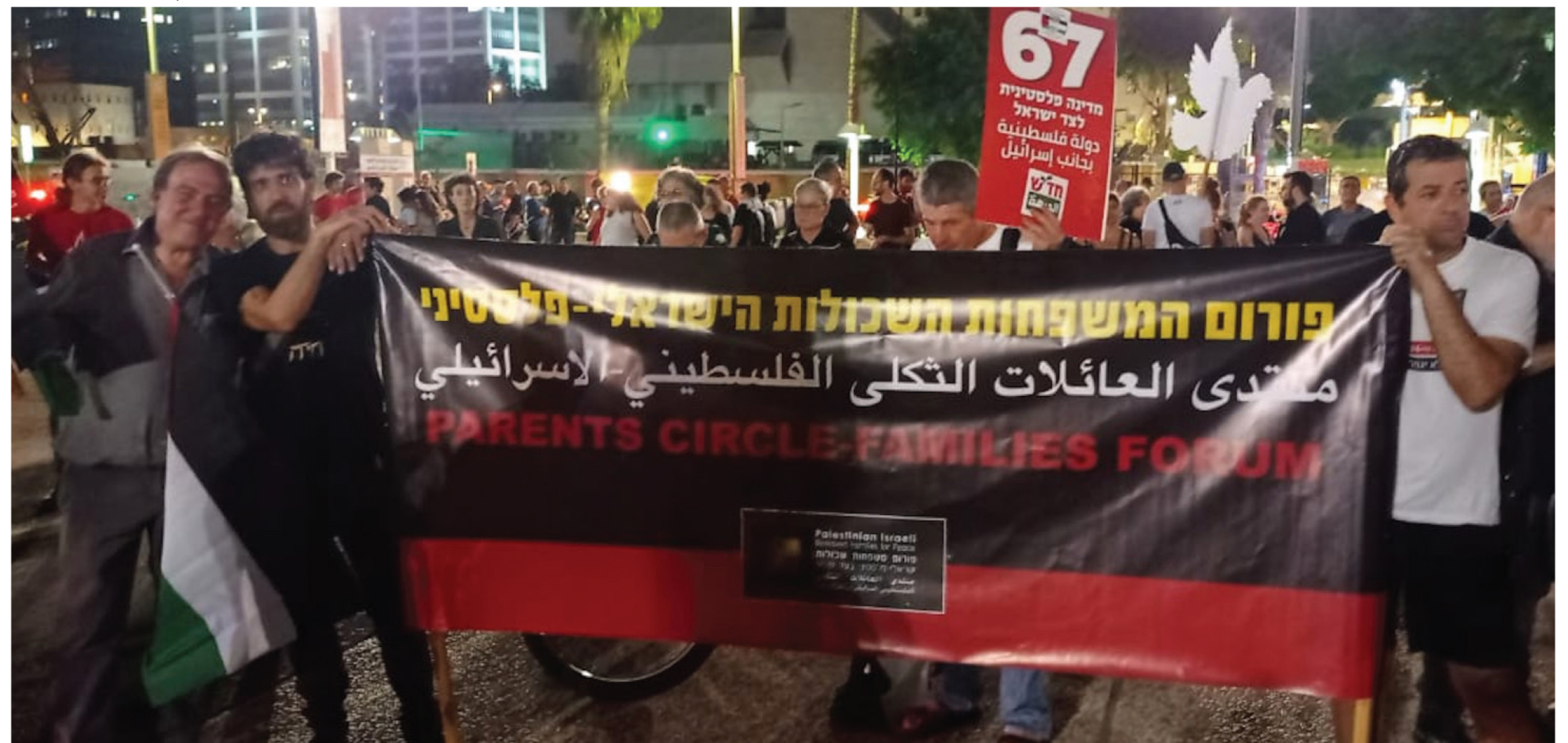
PCFF demonstrating against the recent violence