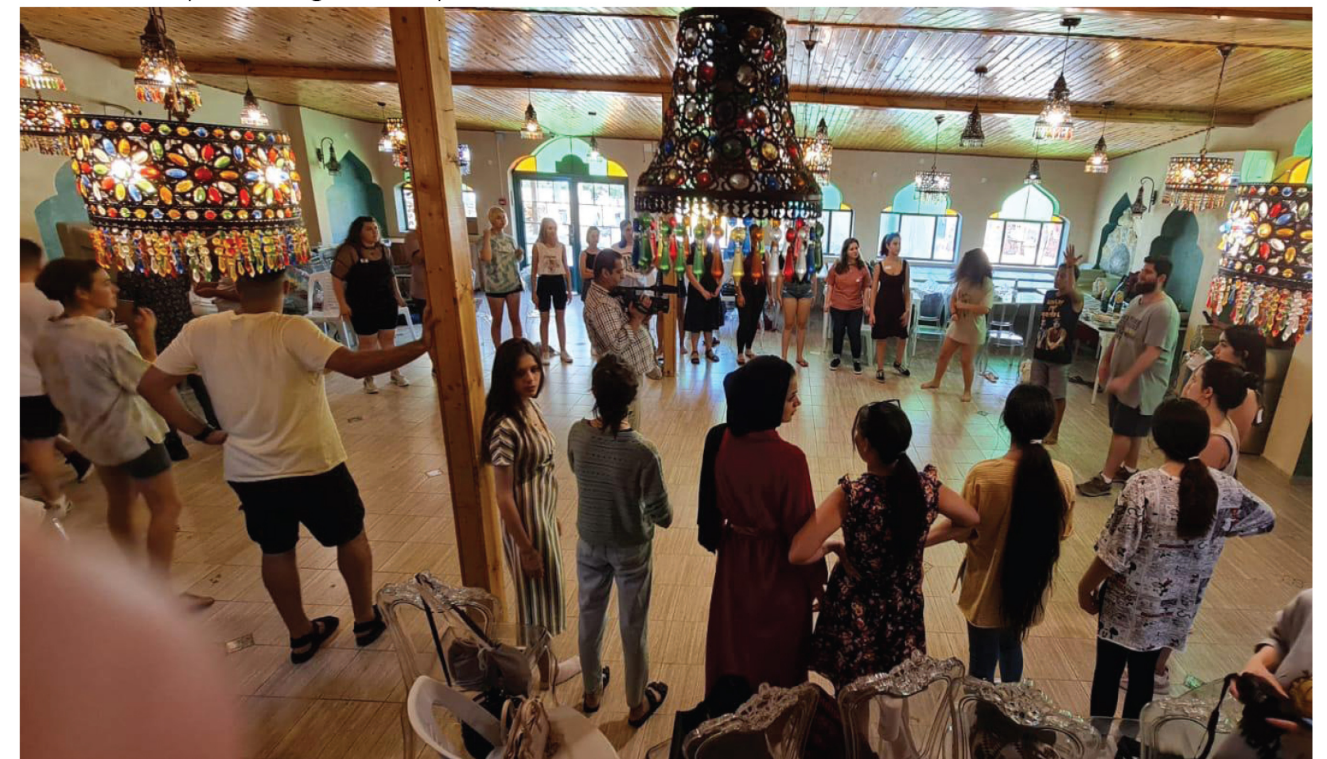
Summer Camp - dialogue circle