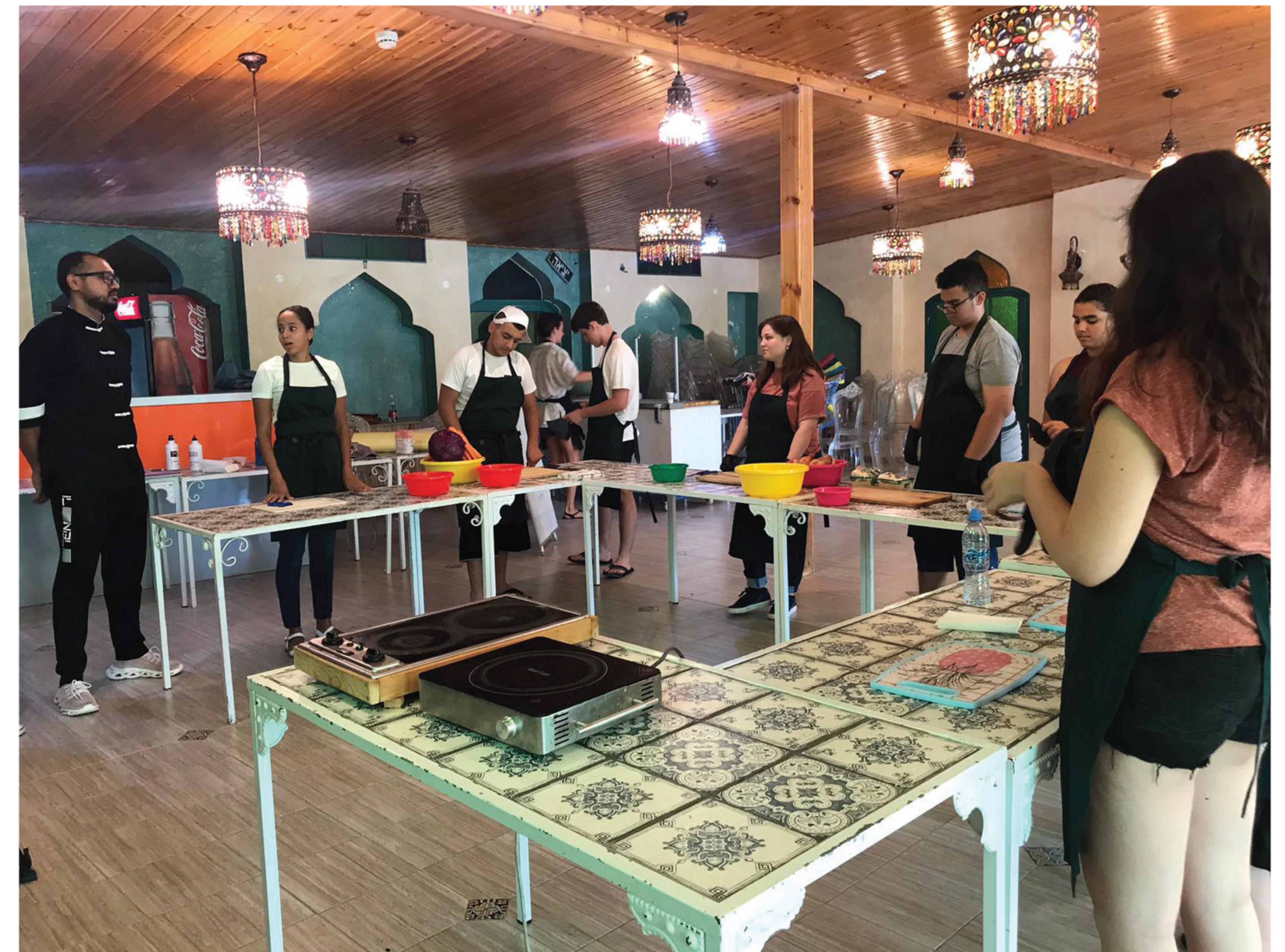
Summer Camp - cooking workshop

It was an emotional experience for all. Sharing a week of intense discussions, team-building and culinary training, allowed for a deeper understanding of the lives of the “other” and therefore the possibility for peace. The Summer Camp also was an opportunity for mothers from both sides to meet as they joined the activities on the last day.