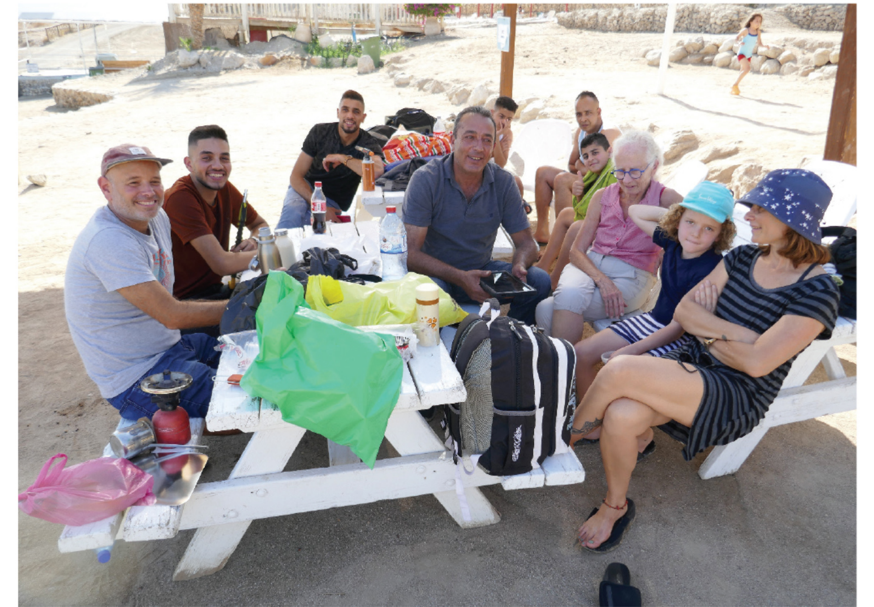
Picnic at the Dead Sea, great to see each other again