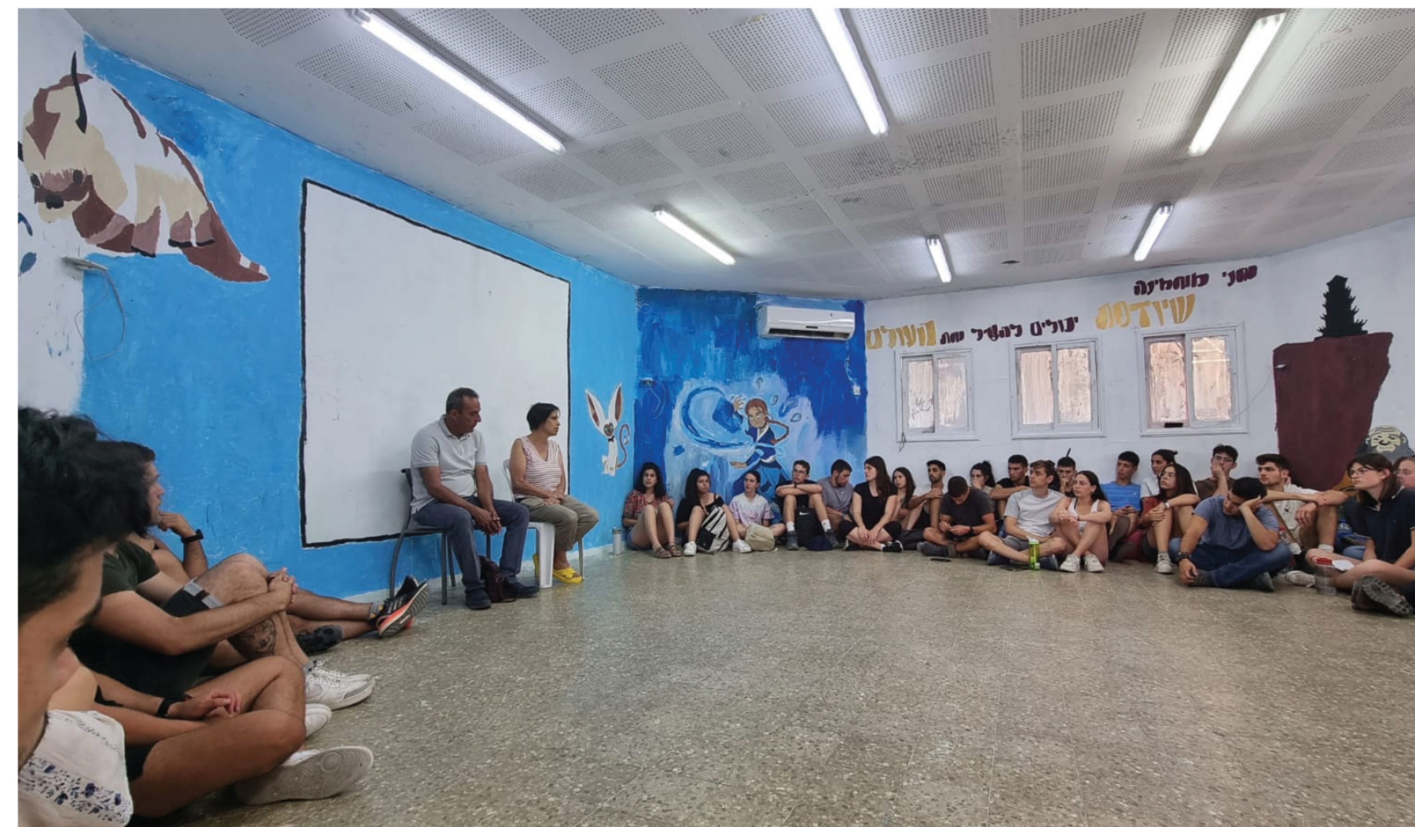
Dialogue Meeting – physical meetings resume