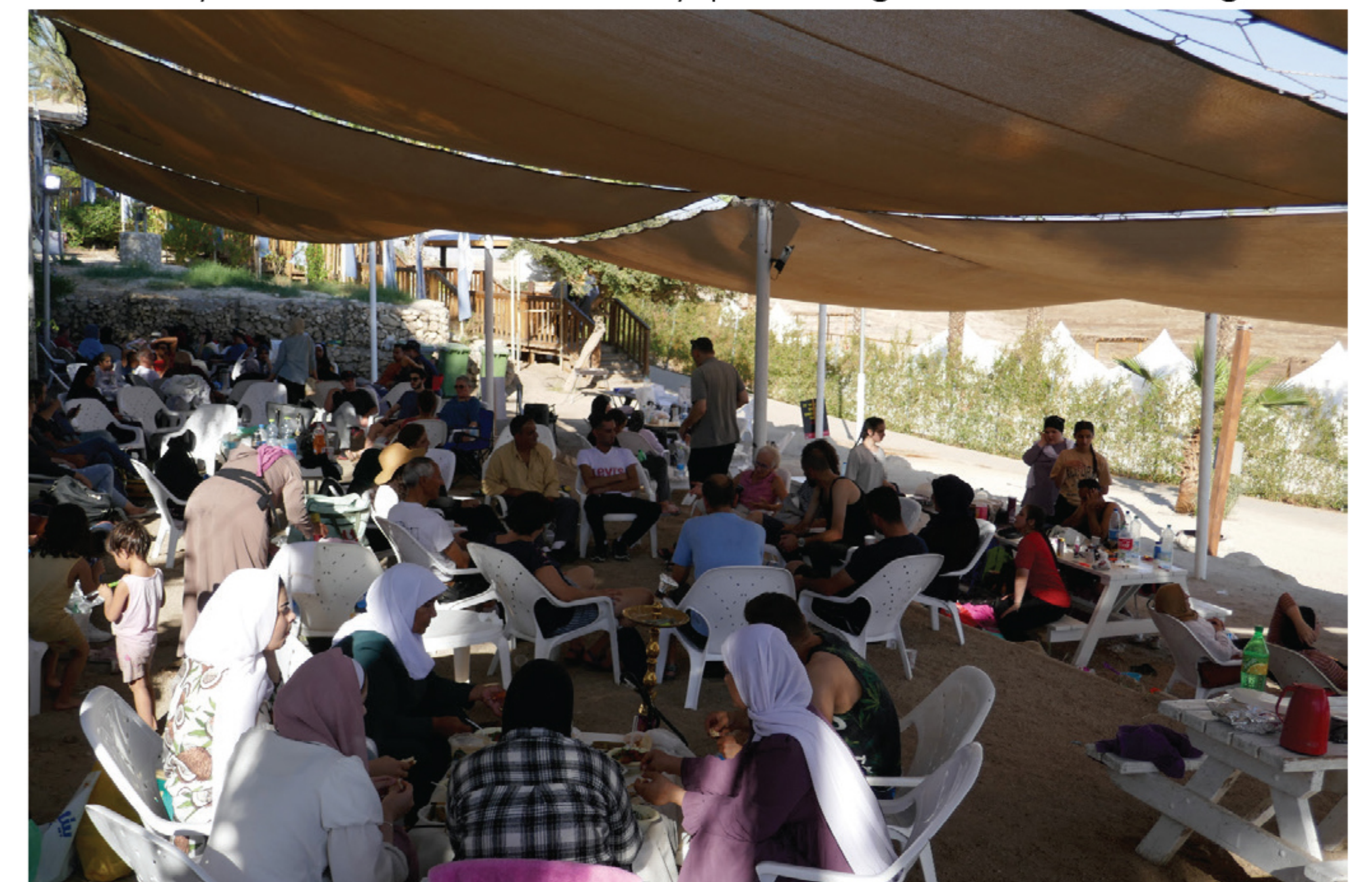
PCFF Members meeting - picnic at the Dead Sea, dialogue circles