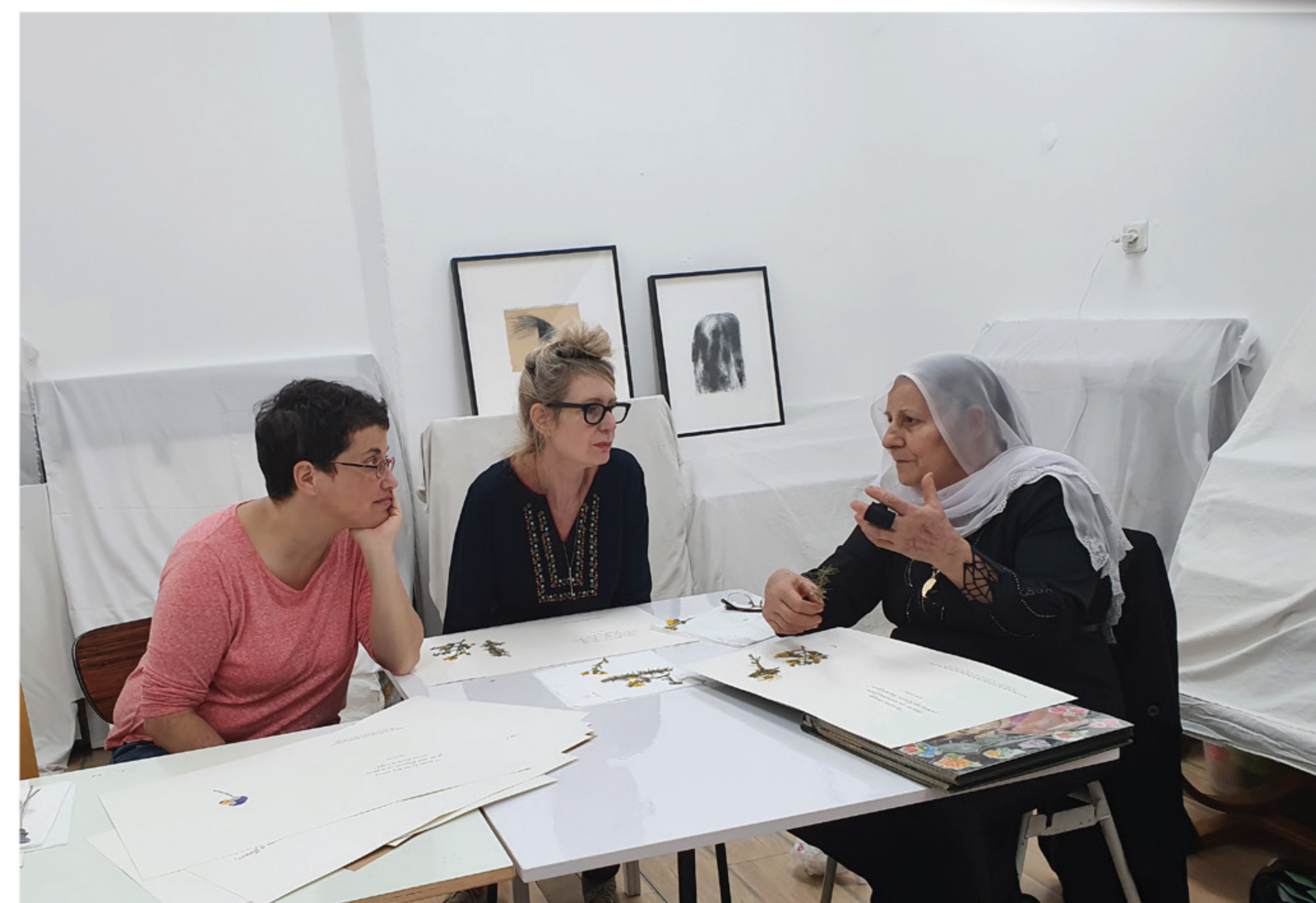
Working on the dried flower album for U.S. VP Kamala Harris