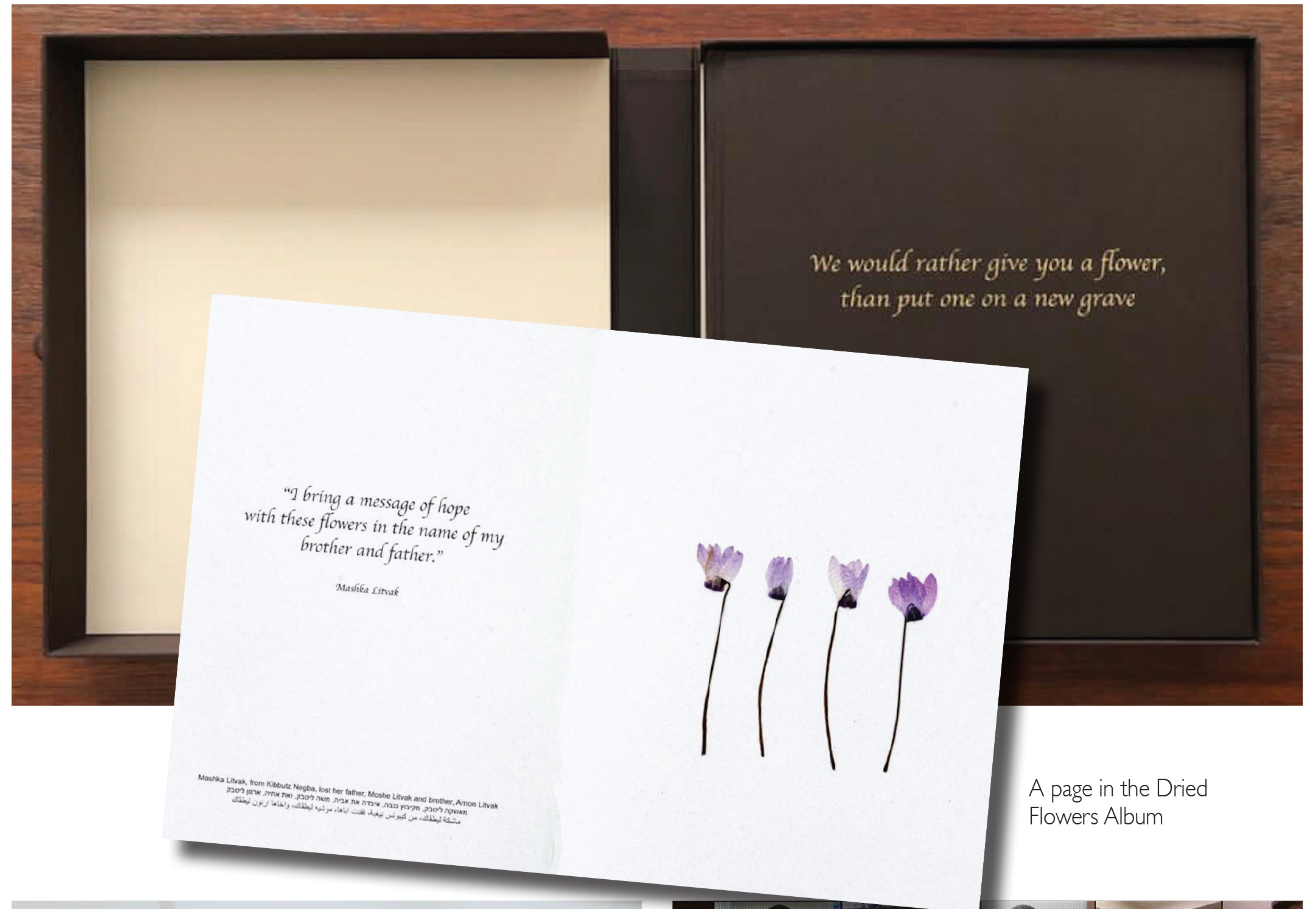
A page in the Dried Flowers Album