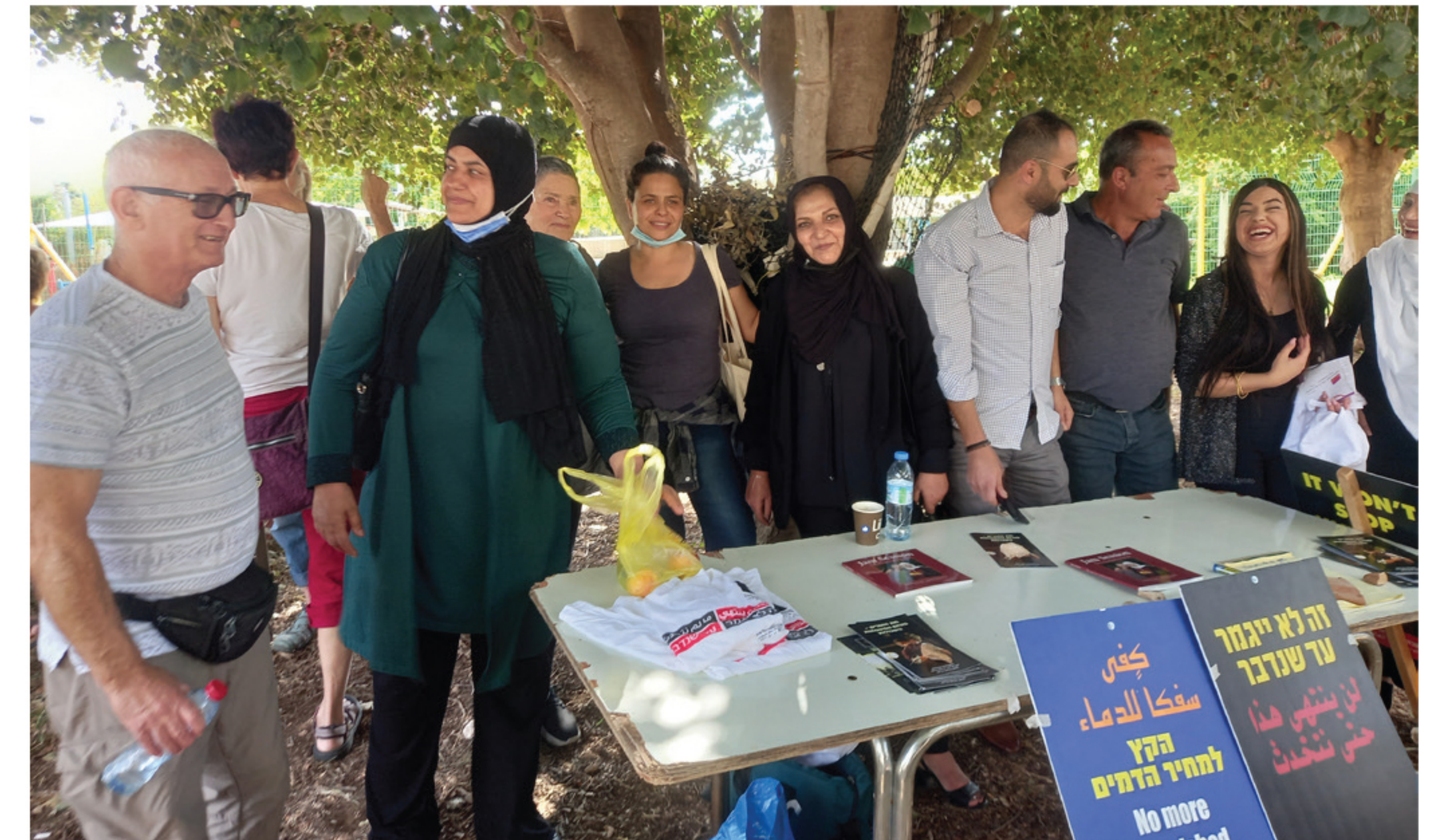
Peace Day in the North, attended by peace organizations, including PCFF