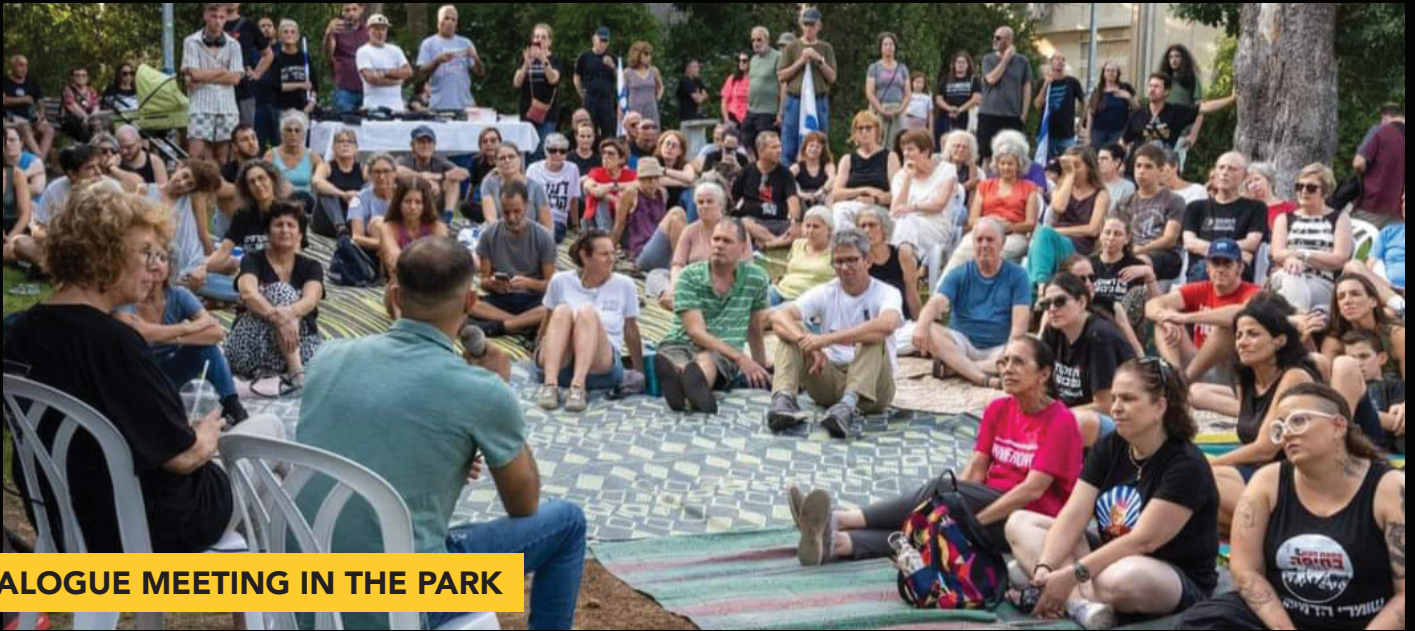
DIALOGUE MEETING IN THE PARK

In a play-on-words on the Hebrew phrase, not in our schools, used to express disapproval for any stated behavior in a given setting, PCFF conducted this campaign in reaction to the Ministry of Education banning our programs from schools.