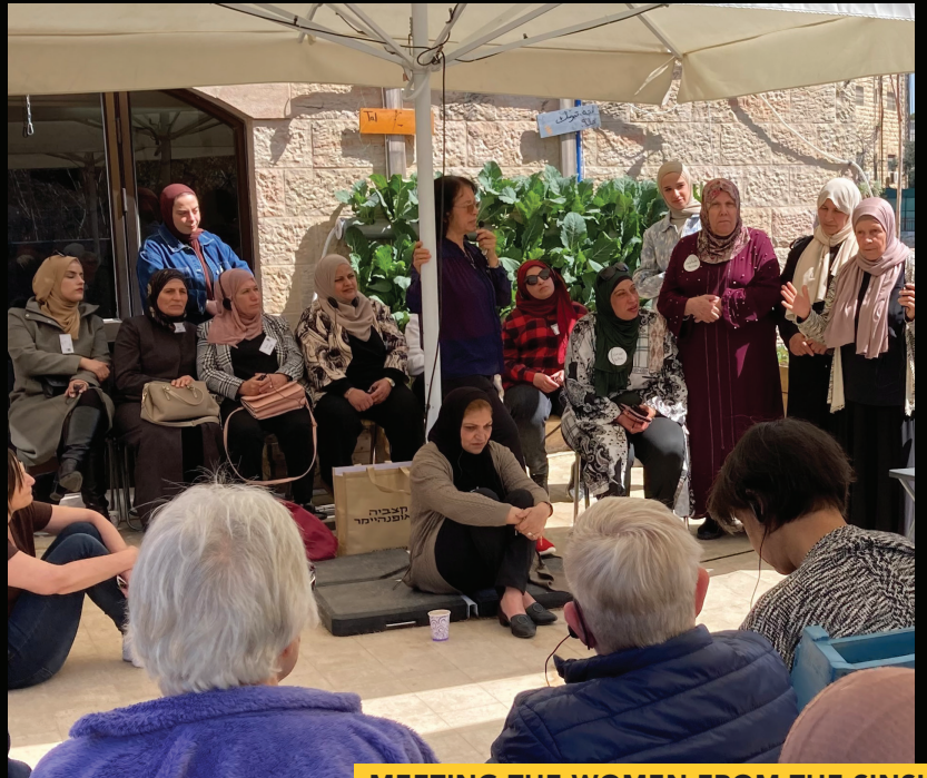
MEETING THE WOMEN FROM THE SINSILA

They learned about women's businesses like the bee project at the Sinsila Community Center in East Jerusalem, as an example of women's leadership and economic empowerment. The Palestinian members of the PCFF shared their experiences in the Wedded to Peace project with the Israeli PCFF women, an initiative in which Palestinian women gained vocational experience in wedding related skills like hairstyling, manicures, makeup, cake making. We held a ceremony in which they received certificates for completing the courses.