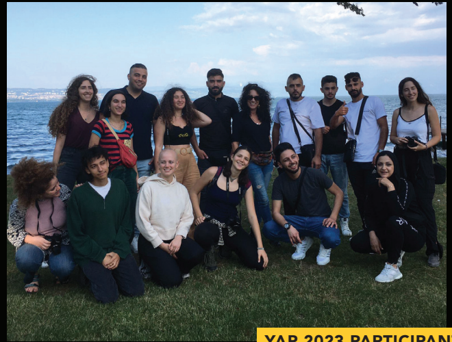
YAP 2023 PARTICIPANTS

Immediately after returning to Israel, the YAPers joined the summer program as counselors, assistant counselors, logistics assistants, and photographers. After October 7, the YAP group held uninational meetings to process and support each other. They expressed desires to meet with the other side.