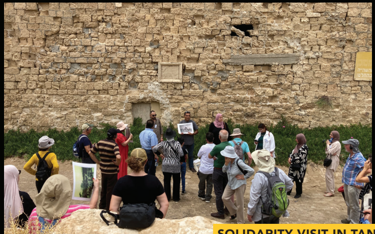
SOLIDARITY VISIT IN TANTURA