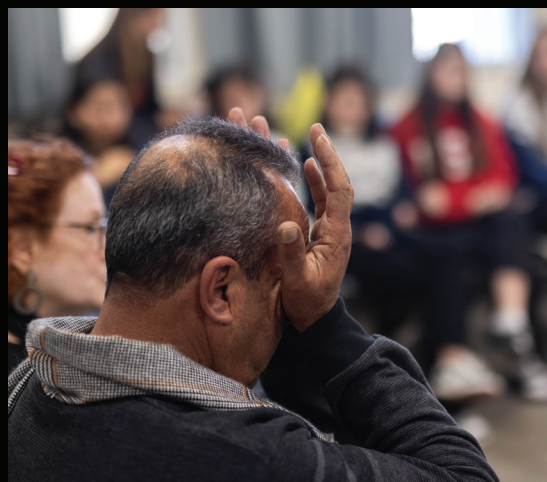
STUDENTS AT A DIALOGUE MEETING

We conducted a total of 300 Dialogue Meetings with 9,550 participants in 2023. They included 166 DMs for the Israeli population. Until the Ministry of Education ban was announced in August, the number of PCFF Dialogue Meetings in Israeli high schools continued to grow in comparison to previous years. Throughout the year, we also held 129 DMs for participants from abroad.