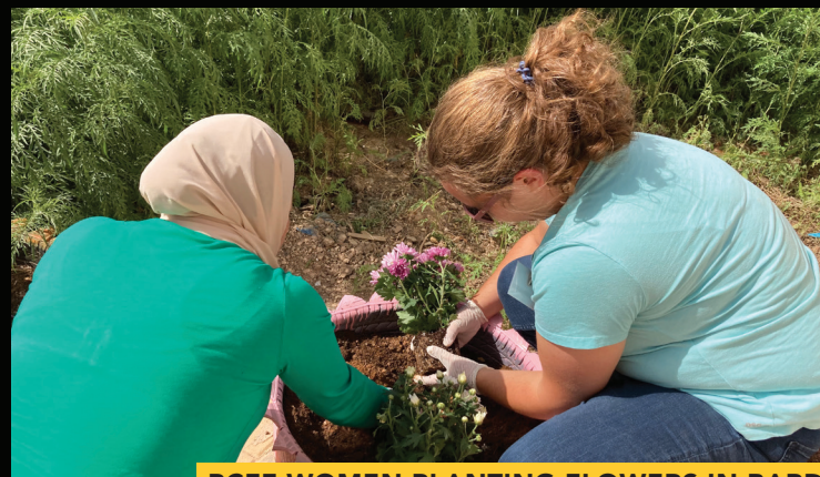
PCFF WOMEN PLANTING FLOWERS IN BARDALLA