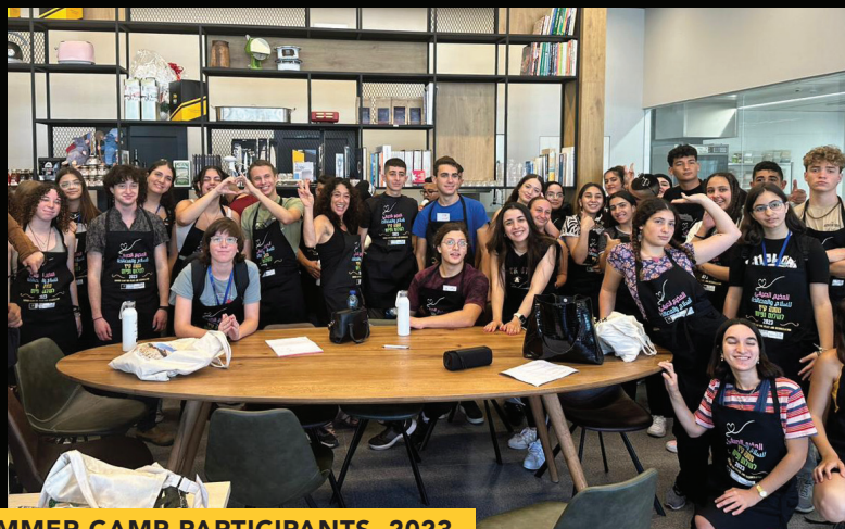
SUMMER CAMP PARTICIPANTS, 2023

The 2023 Summer Program was held for eight days at the Ben Shemen Youth Village in Israel. Despite attempts to cancel the camp by Members of Knesset and mountains of bureaucratic challenges, the Summer Camp program was declared a great success. There were 50 teenagers, 25 Palestinians and 25 Israelis, ages 14-18 who participated. The counselors were from our YAP (Young Ambassadors for Peace) program and the close relationship between them was projected on the summer program participants generating an atmosphere of honest and respectful dialogue.