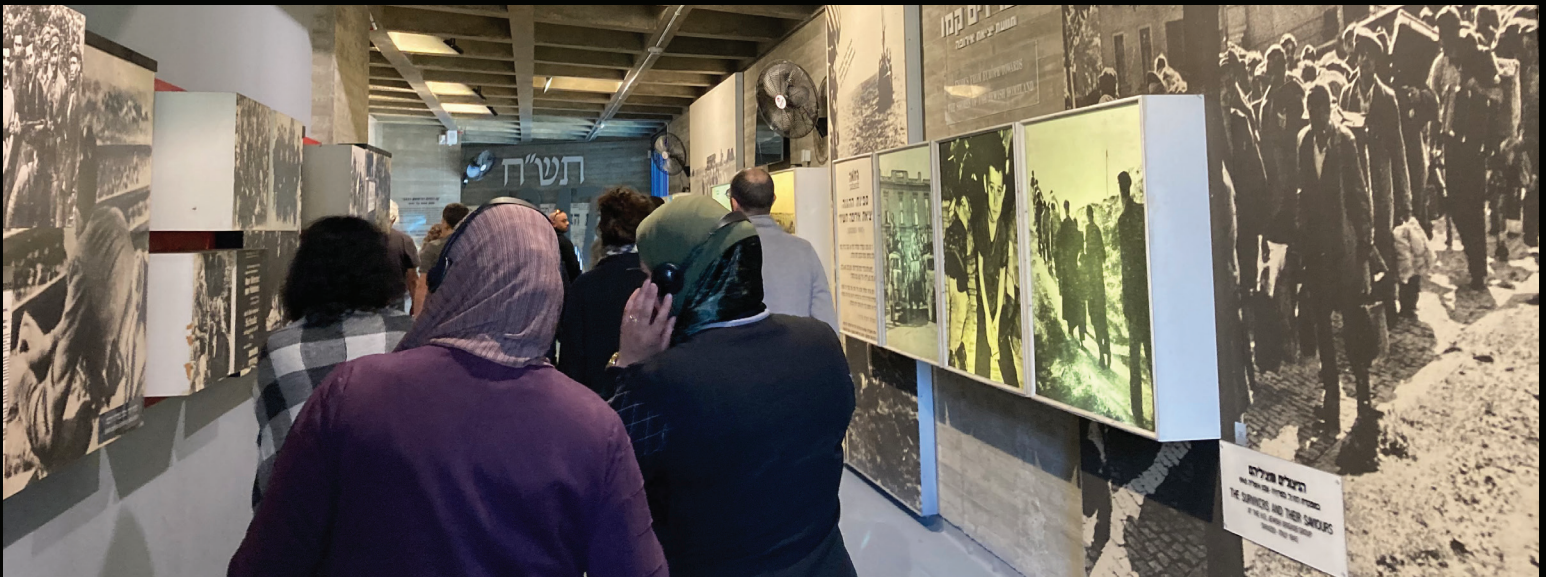
LIBERAL PROFESSIONALS PNE GROUP AT KIBBUTZ YAD MORDECHAI MUSEUM, FROM HOLOCAUST TO RESURRECTION

After the war began, we held virtual meetings for Israeli and Palestinian PNE alumni and we encouraged our alumni to engage in one-on-one conversations with the other side to show empathy.