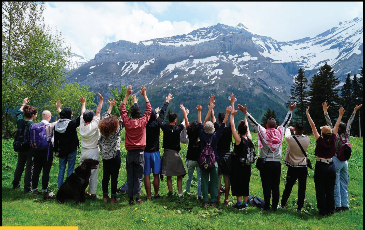
YAP IN SWITZERLAND