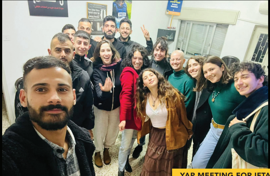
YAP MEETING FOR IFTAR

Our unique character as an Israeli-Palestinian organization positions us to model the message of reconciliation and deliver it to the public, making it resonate and change attitudes in both Israeli and Palestinian society.